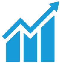
ECONOMIC GROWTH AND DECENT WORK

We recognise our responsibility in this process and are fully committed to making a significant contribution to reducing our environmental impact and promoting responsible business practices.