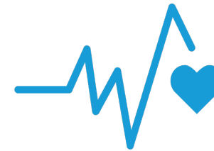
GOOD HEALTH AND WELL-BEING